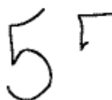
Fig. 3.8. A child's representation of five and one-half

representation are important to consider in school mathematics.